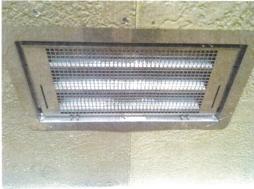
SMART VENT MODEL # 1540-510 06/26/2014