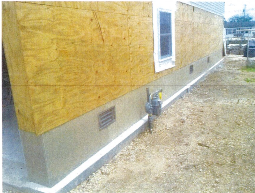
RIGHT SIDE VIEW – 06/26/2014

If submitting more photographs than will fit on the preceding page, affix the additional photographs below. Identify all photographs with: date taken; "Front View" and "Rear View"; and, if required, "Right Side View" and "Left Side View." When applicable, photographs must show the foundation with representative examples of the flood openings or vents, as indicated in Section A8.