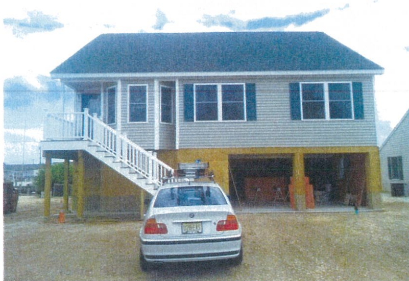
FRONT SIDE VIEW – 06/26/2014

If using the Elevation Certificate to obtain NFIP flood insurance, affix at least 2 building photographs below according to the instructions for Item A6. Identify all photographs with date taken; "Front View" and "Rear View"; and, if required, "Right Side View" and "Left Side View." When applicable, photographs must show the foundation with representative examples of the flood openings or vents, as indicated in Section A8. If submitting more photographs than will fit on this page, use the Continuation Page.