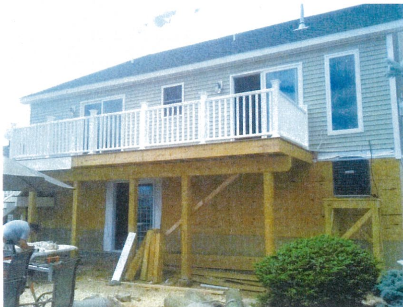
REAR SIDE VIEW – 06/26/2014