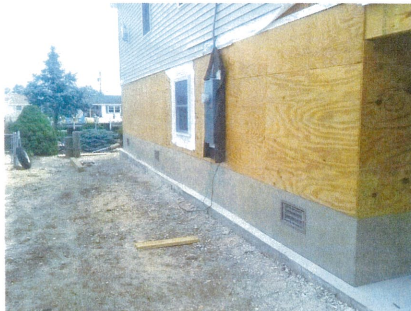
LEFT SIDE VIEW – 06/26/2014